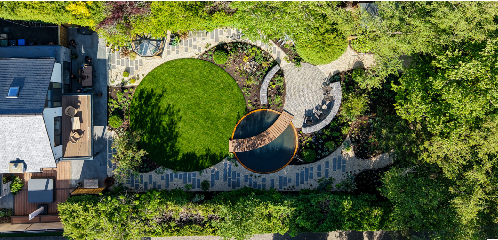
Aerial view of a recently completed Southern Green garden design